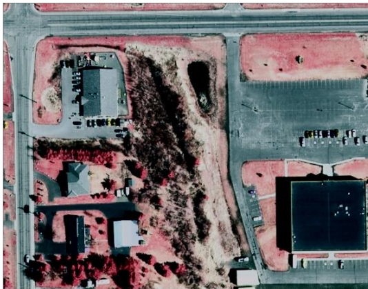
2009 spring 1-foot color infrared

The State expects to have funds sufficient to provide 0.5-meter resolution imagery acquired with four spectral bands, such that imagery can be displayed as either natural color or color-infrared. The imagery will be ortho-rectified to create map-ready images with a horizontal accuracy of 11.6 feet (3.5 meters) or better (expressed as root mean square error).