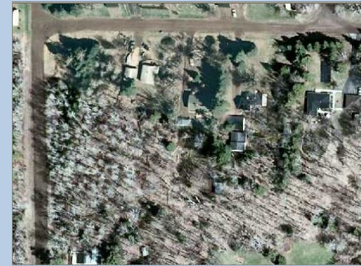
Spring Leaf-Off Image