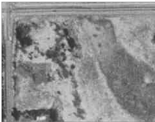
1991 spring 1-meter black and white

The State of Minnesota has provided funding through the Environmental and Natural Resources Trust Fund for a phased update of the National Wetland Inventory. The update of the NWI requires up-to-date, spring leaf-off aerial imagery. The State is seeking partnership opportunities to leverage this funding to acquire high quality, high-resolution spring imagery statewide.