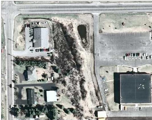
2009 spring 1-foot natural color