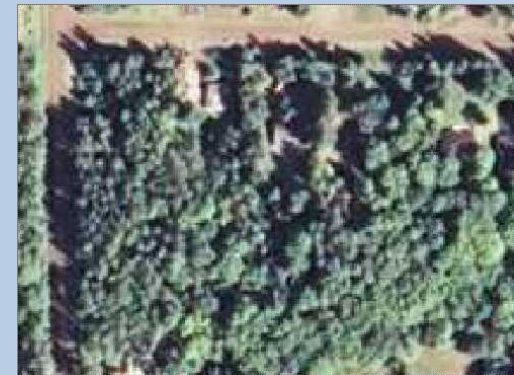
Summer Leaf-On Image