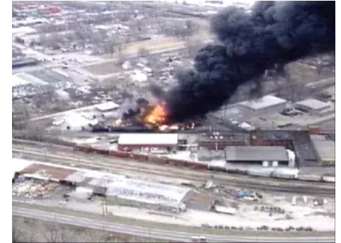
An Initiative Supporting the National Map, National Spatial Data Infrastructure, Emergency Response and Homeland Security

The Minnesota Structures Collaborative was designed to develop the partnerships and technical capacity needed to support the long-term collection, publication and maintenance of databases pertaining to four types of structures in Minnesota: